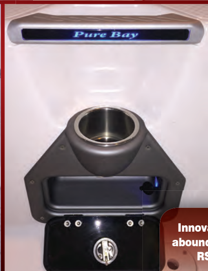
Innovations abound in the RS1.