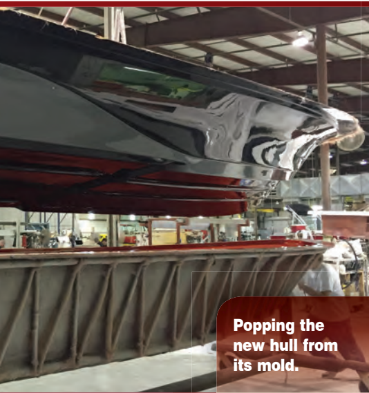
Popping the new hull from its mold.

Overall length is twenty two feet eight inches with a beam of eight foot six inches. The Pure Bay - RS1 has many