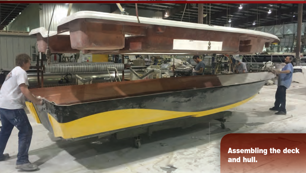
Assembling the deck and hull.