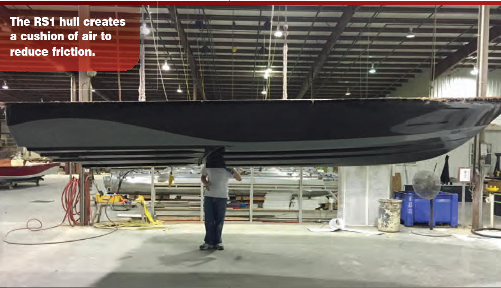
The RS1 hull creates a cushion of air to reduce friction.